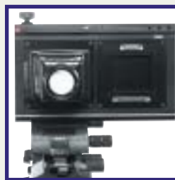
CSL-269 Sliding adapter