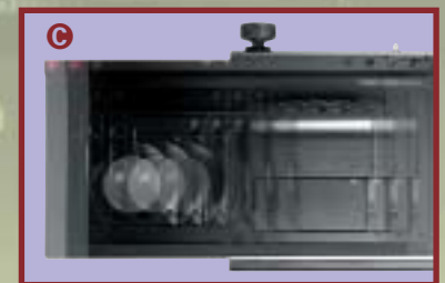
The Multistep Adapter allows for stitched file sizes of appr. 85 Mb with the 11Mpixel chips (3-steps), appr. 86 Mb for the 16Mpixel chips (2-steps) and appr. 112 Mb for the 22Mpixel chips (2-steps) (8-bit)