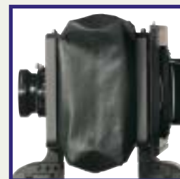
SF-323 Wide Angle Bellows