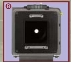
Direct adapting plate (DP-23) with Hasselblad mount (SL-80)