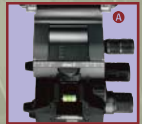
Focal plane adjustment slot on rear standard

Since digital backs and compatible electronic shutter systems can weigh significantly more than traditional film backs and lenses, it is important to have a camera that provides a solid foundation and unswaying support. The Ultima 23 provides just that. Its rigidly designed base-tilt mechanism provides an extremely stable platform for heavy digital accessories