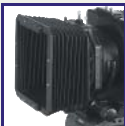
C-342 Compendium Lens Shade