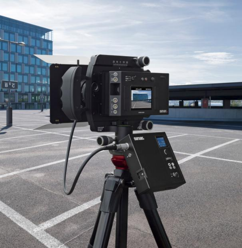
Sinar eControl, Sinaron Digital Lens with an eShutter, and a Sinarback S 30|45 on a Sinar LanTec Camera, ready to capture an architectural image.