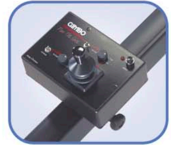
PT-903 Control Unit

Designed for the DV and Mini DV camera range, the PT-900 has a weight capacity of 10kg (22 lbs.). It provides precision-controlled motorised camera movements with the V40 Video Boom. The PT-903 Control Unit operates the two motorised units for full camera control with 350° pan and/or tilt. A switchable direction control allows you to set rotation direction on both movements or switch either off. The maximum speed is determined by two independent controls. Included is a 100 – 240V 12V DC power supply with a XLR-4 output connector. An optional V-battery mount is also available to accommodate many industry-standard batteries. The PT-900 has standard an integrated LANC signal put-through connection.